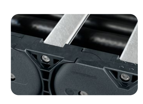
Very smooth running of the roller system due to almost continuous running surface.