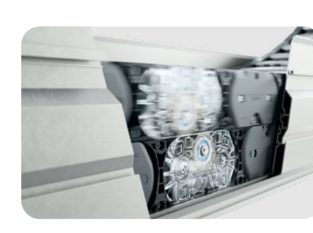
Roller chain for travel distances up to 1200 m.