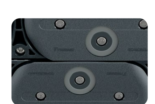
RSD version with roller damping to reduce noise and wear by up to 50 %.