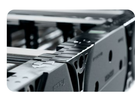
A non-slip structure on the running surface prevents one-sided roller wear after a standstill.